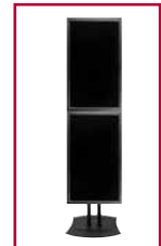
Dual Display Portrait (requires ACC604 adaptor)