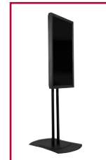
Single display Portrait